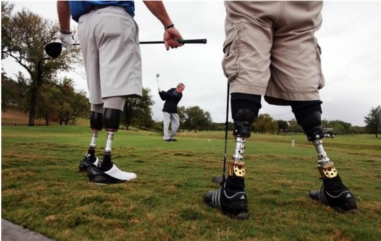
President Bush plays golf with wounded veterans at the Warrior Open tournament.