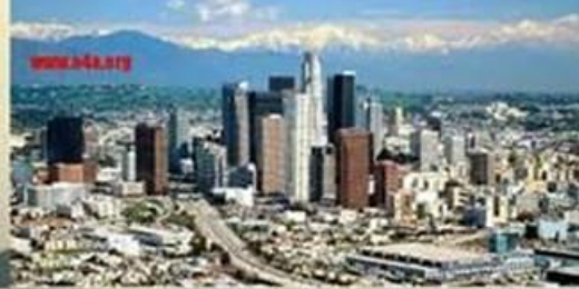
LOS ANGELES 2017