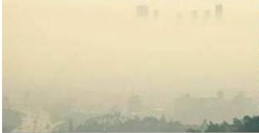
LOS ANGELES 1984