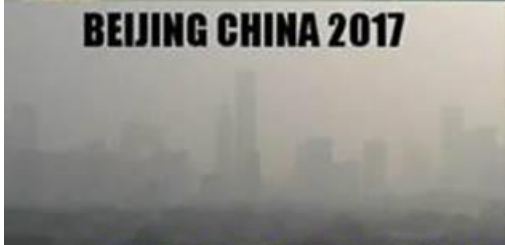
BEIJING CHINA 2017