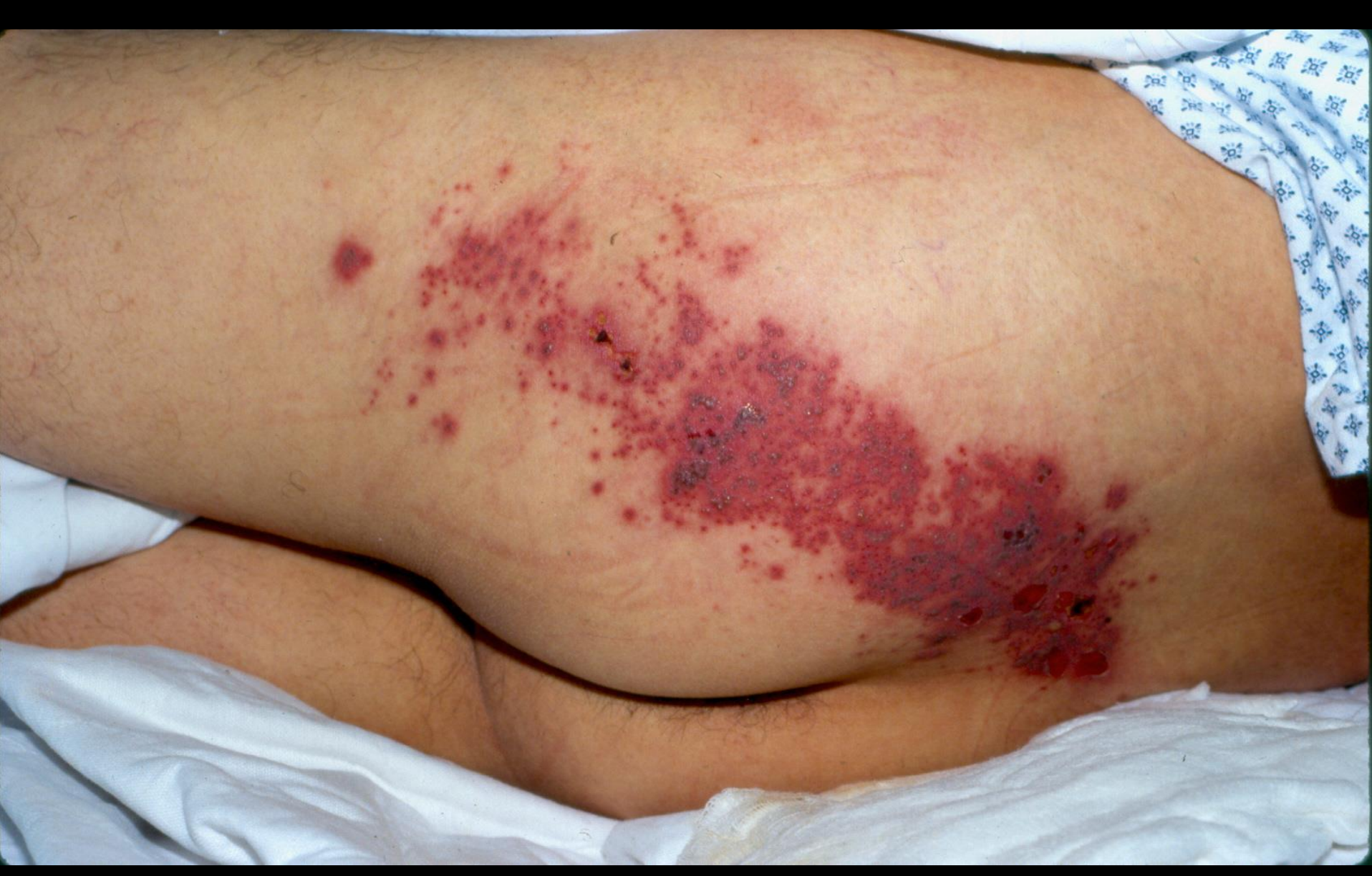
Band-like area of vesicles (hemorrhagic vesicles)